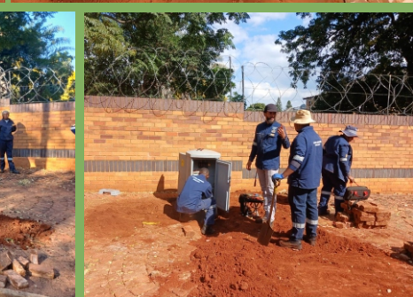
New cable & 3 phase meter installation at Kruger Str in Mokopane