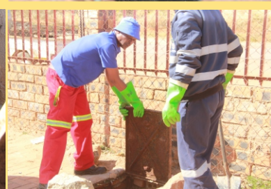
Unblocking of sewer line at Zone 1 in Mahwelereng