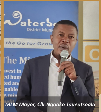
MLM Mayor, Cllr Ngoako Taueatsoala