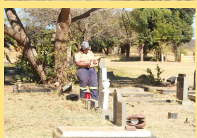
Bush clearing at Mokopane cemetery