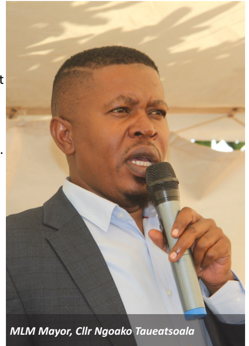
MLM Mayor, Cllr Ngoako Tauetsoala

In response, the Mogalakwena Local Municipality assured communities that all issues raised would be noted and attended to. Issues requiring the attention of other stakeholders and sector departments would be referred. The municipality emphasized that Uitspanning would be prioritized, despite not being included in the Jakkalskuil Water Scheme and that basic services would be rendered. The municipality's maintenance and operation teams are on the ground addressing community queries and projects like the Jakkalskuil Water Scheme are expected to benefit 38 villages with clean water.