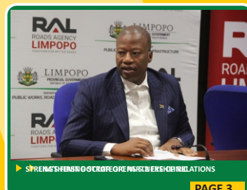
STAKEHOLDER ENGAGEMENT SESSION