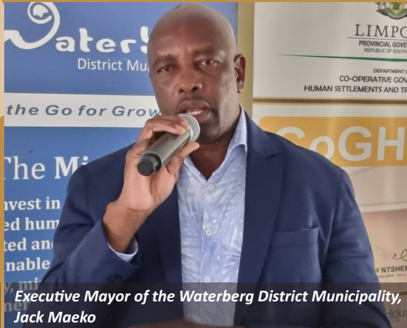
Executive Mayor of the Waterberg District Municipality, Jack Maeko