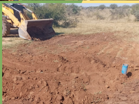
Pipe burst maintenance and replacement at Makekeng Village in Bakenberg Cluster