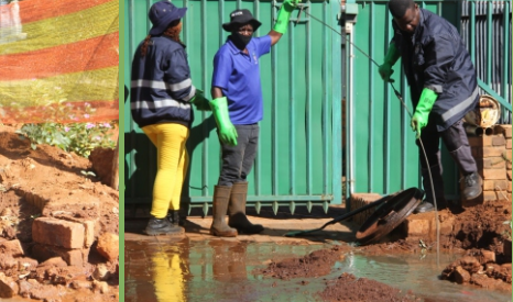
Unblocking of sewer line at Platina str in Mokopane