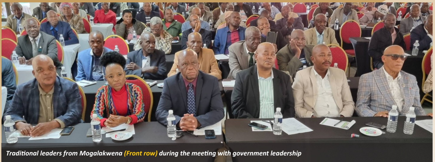
Traditional leaders from Mogalakwena (Front row) during the meeting with government leadership