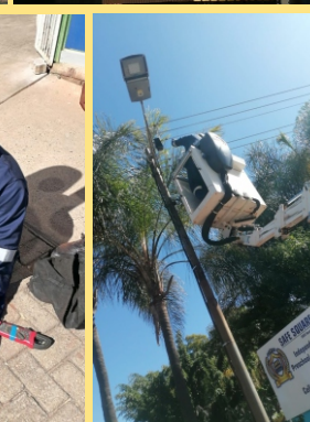
Street lights maintenance at Rabe and Nelson Mandela Str in Mokopane