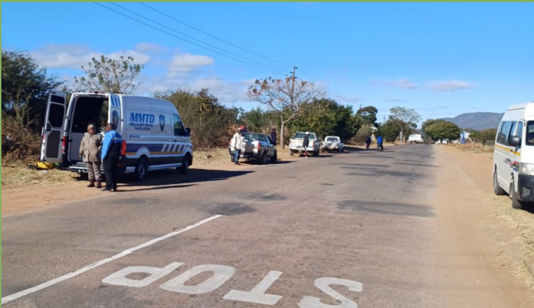
Number plate recognition operation at EXT 17 in Mokopane