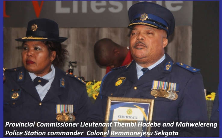
Provincial Commissioner Lieutenant Thembi Hadebe and Mahwelele-reng Police Station commander Colonel Remmonejesu Sekgota