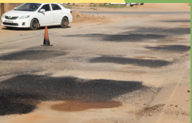
Patching of potholes at Molalaggori str in Mahwelereng