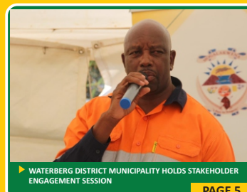
WATERBERG DISTRICT MUNICIPALITY HOLDS STAKEHOLDER ENGAGEMENT SESSION