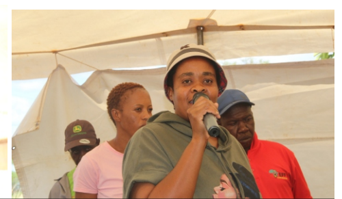
Members of the community participating during the IDP & Mayoral Roadshow